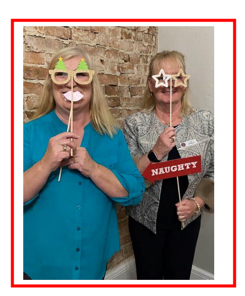
Renew Your Membership at the January Meeting!!!!