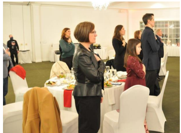
We honor our flag and our country.