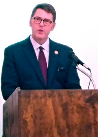
TN State Senator Shane Reeves shares news about covid vaccines.