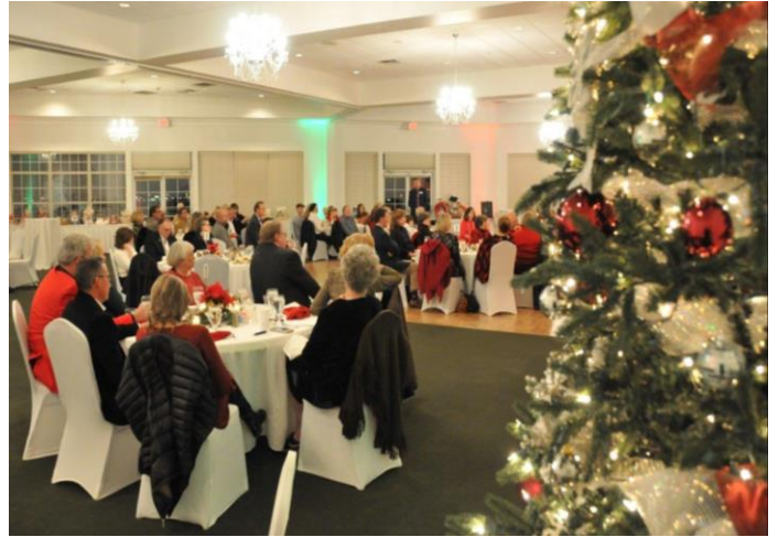
Tennessee Philharmonic Orchestra Quartet