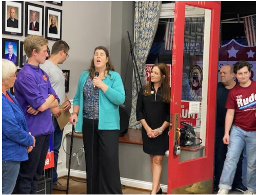
Senator Dawn White

On October 23 rd the Republican Legislators stopped in Murfreesboro to rally everyone to get out and vote. It was a great reminder to all how important each vote is.