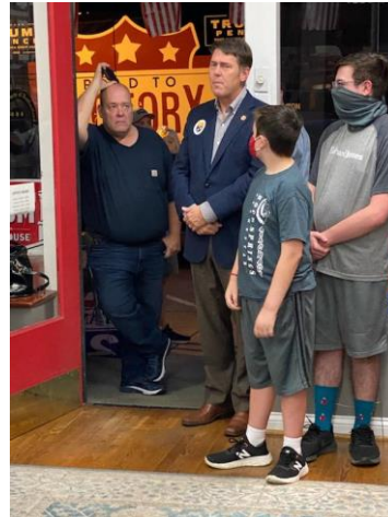
Senator Shane Reaves