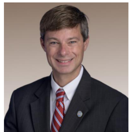
State Representative Charlie Baum of 37 th District